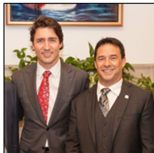
With Justin Trudeau discussing housing affordability