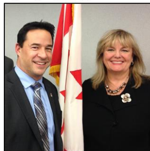
With Minister Findlay for action on the underground economy