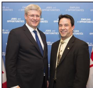
With Prime Minister Harper on infrastructure investment

Our industry numbers are key in all our government advocacy, highlighting the economic importance of our industry.