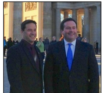
With Minister Kenney for action on skilled trades